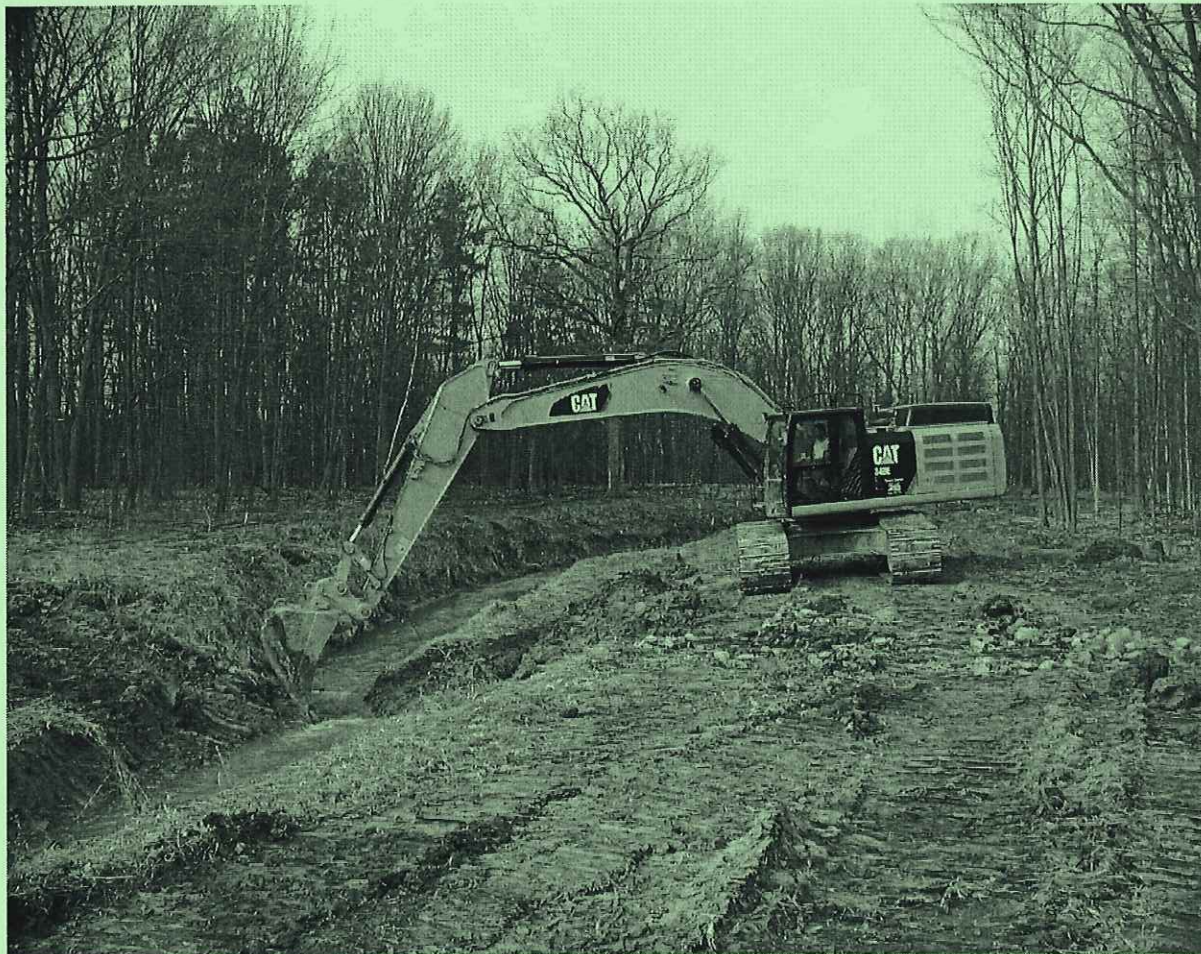
Hoppler Creek Drain Project